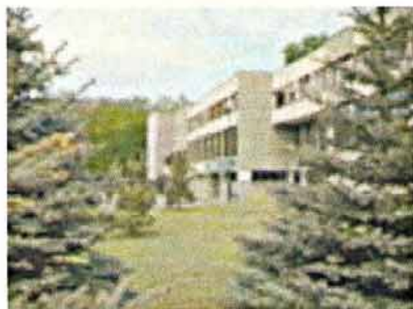
Archdiocesan Retreat Center at Bielany, Warsaw

The four-day conference included sessions on the Dignity of Motherhood, the Foundations of Obstetrical Practice, Human Dignity and Fertility, the Culture of Life and Obstetrical Practice, Valuing Human Life in Difficult Situations, Conscience and Obstetrical Practice, Consequences of the Reproductive Health Agenda, and Challenging the Status Quo.